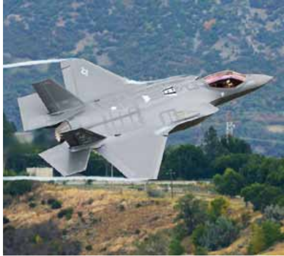
F-35A Lightning II in test flight

The preferred and reasonable alternatives are expected to be selected in the fall and the F-35As are slated to begin arriving at the first Reserve-led F-35A location by the summer of 2023.